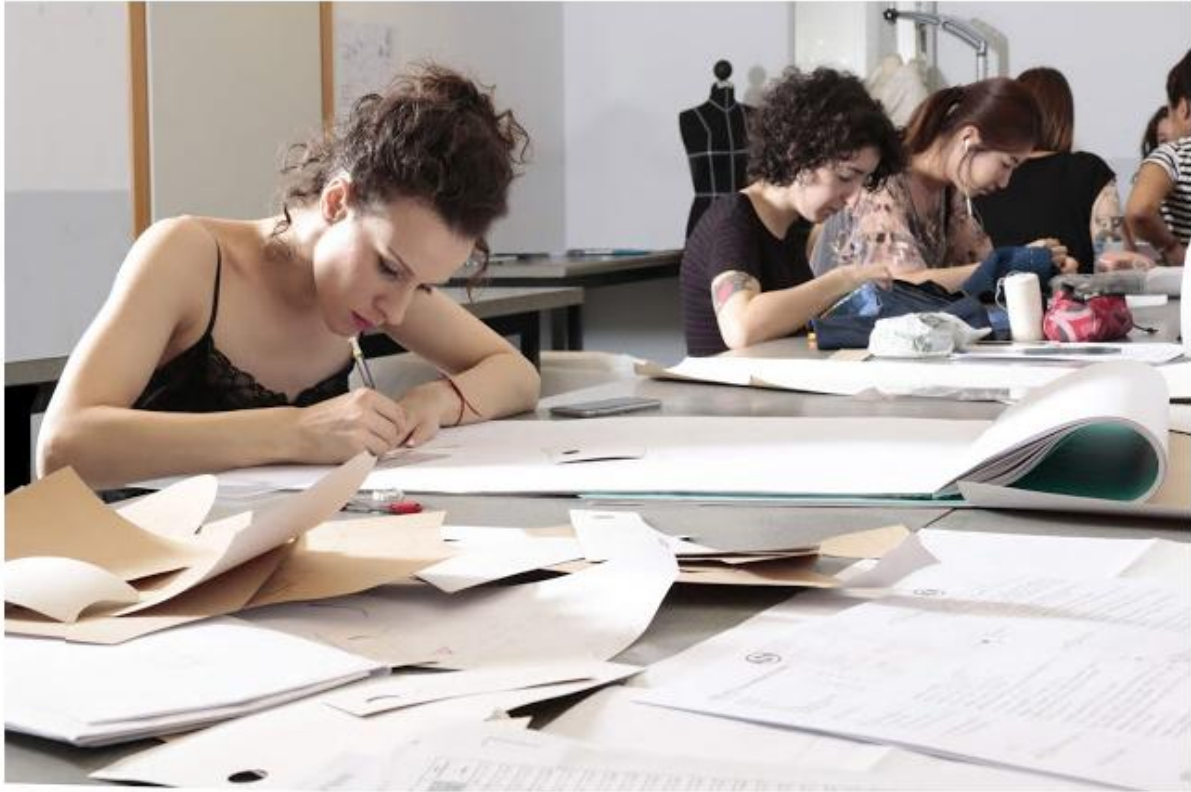
Students working in one of the Istituto Secoli's patternmaking laboratory

Effectively one of the most impressive things about this school, which I had the opportunity to see first hand visiting the school a while back and also during the Graduation Days , is the atmosphere of deep seriousness that you can breath in the classrooms and laboratories. Hundreds of students, most of whom coming from Far East and in particular from China, South Korea and Japan, who work with the utmost attention without almost taking their eyes off from their work, completely immersed in a world made of measures, details and fabrics. Each in search of the absolute perfection.