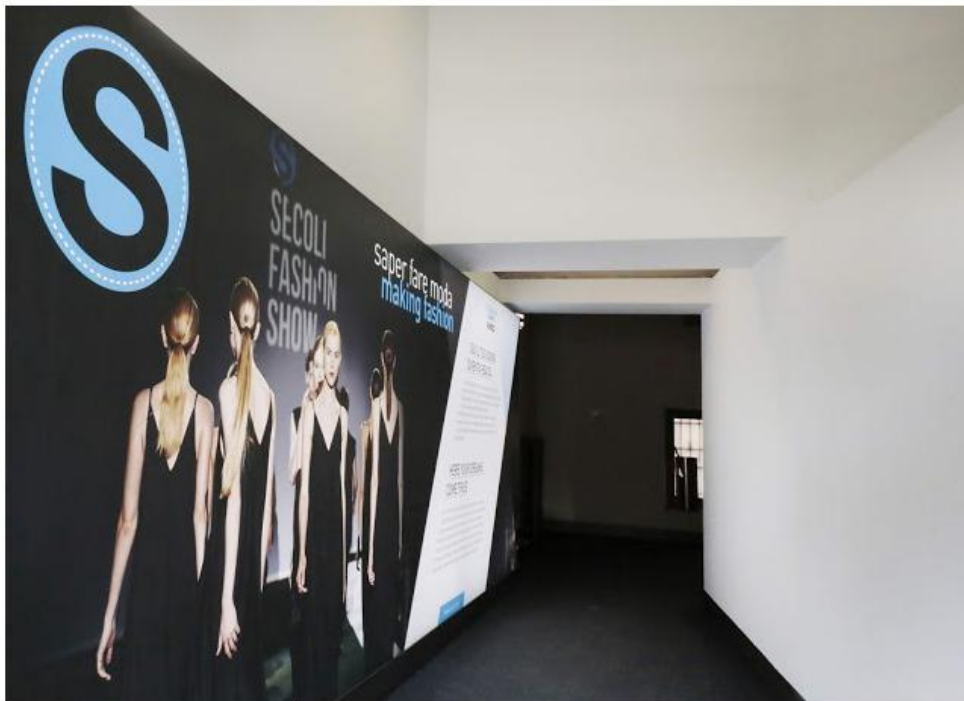
Istituto Secoli's headquarter in Milan

What can I say more about Istituto Secoli?