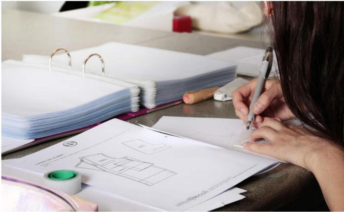
Working on flat drawings

Very interesting are the Specialist Courses which have duration and lessons frequency perfect for students and workers who want to deepen certain topics in a flexible way compatible with their needs and an affordable price, up to 3500 Euro each: