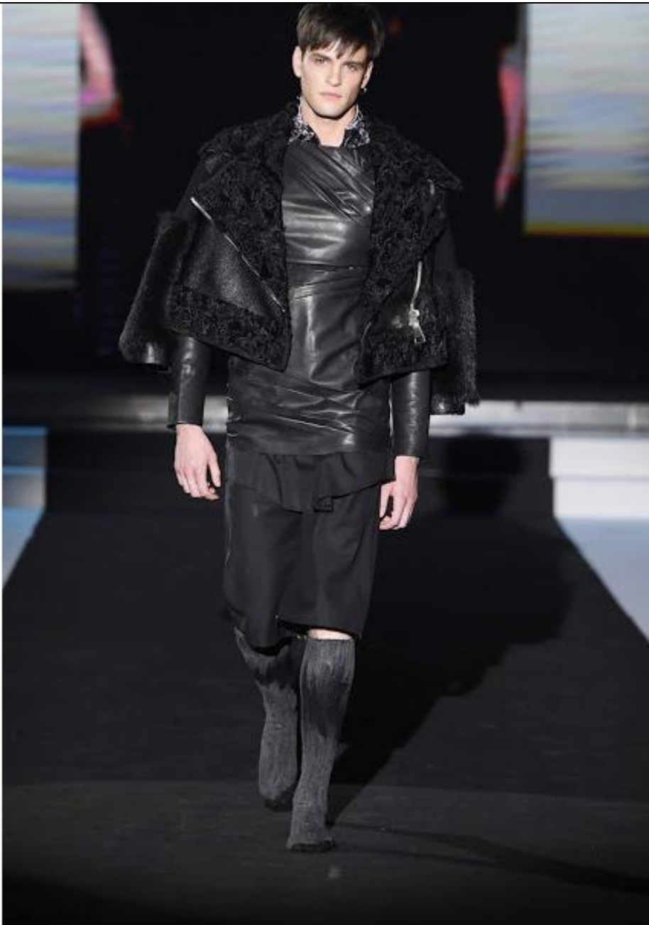
Outfit by Filippo Todisco