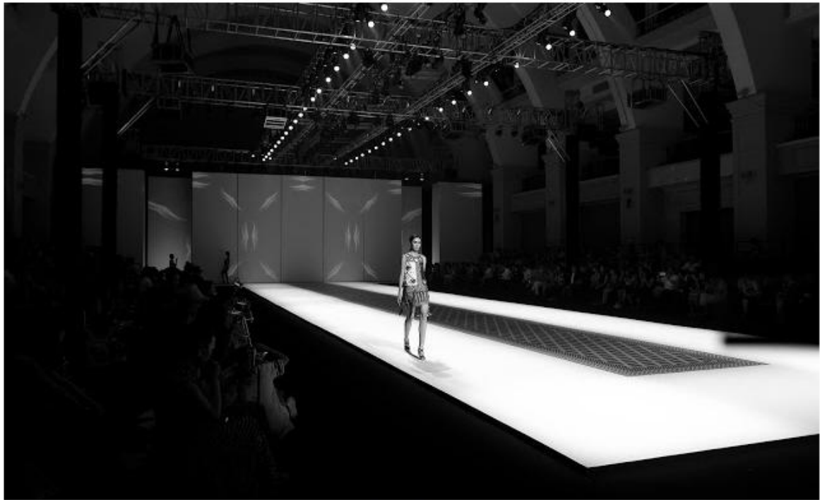
"Secoli Fashion Show"