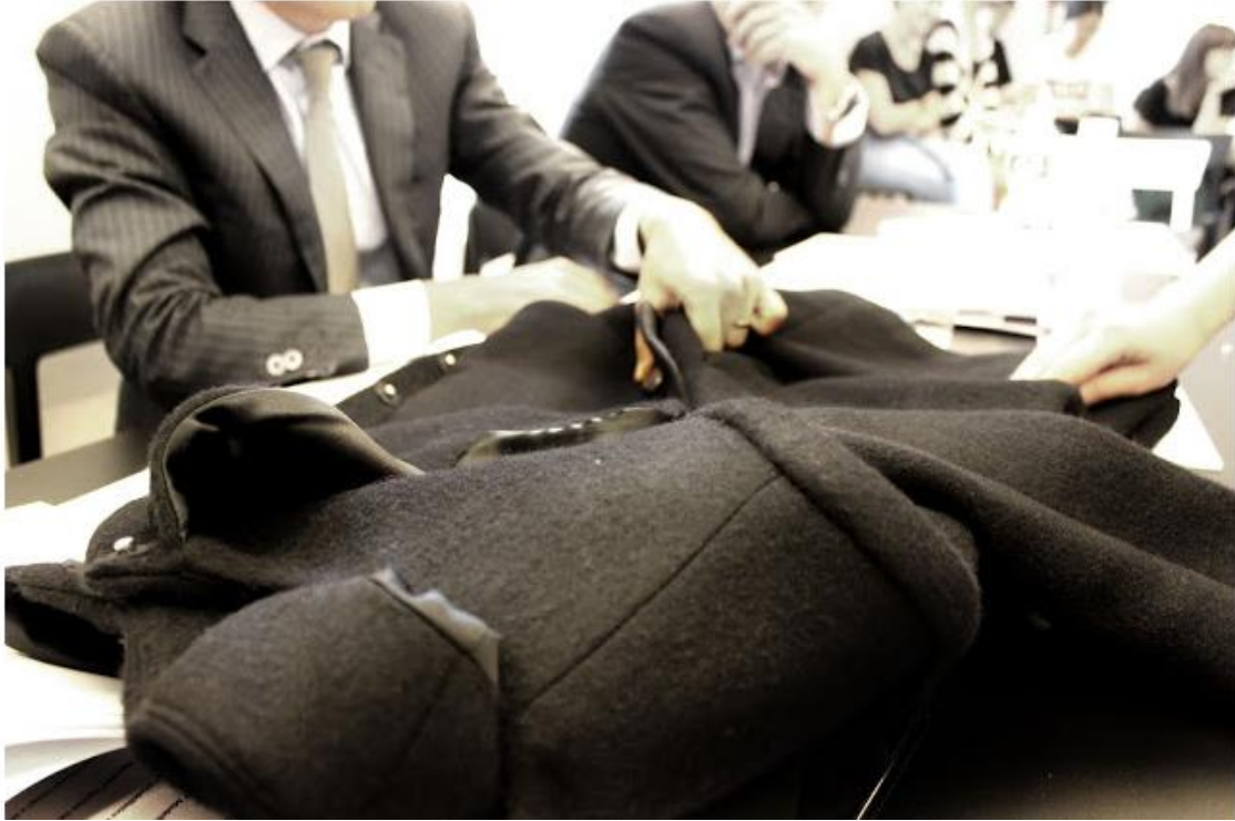
The jury evaluating the student's works during the Graduation Days

All the courses of Istituto Secoli are accredited by Regione Lombardia since 2004 and release a certificate to students at the end of the training program and after a final test. For the 3-years Academic Courses and the Master Courses each student must present a Thesis Project with a portfolio, a technical book and three prototypes, which are evaluate by a jury formed by renowned professional of the sector and the Secoli's Director.