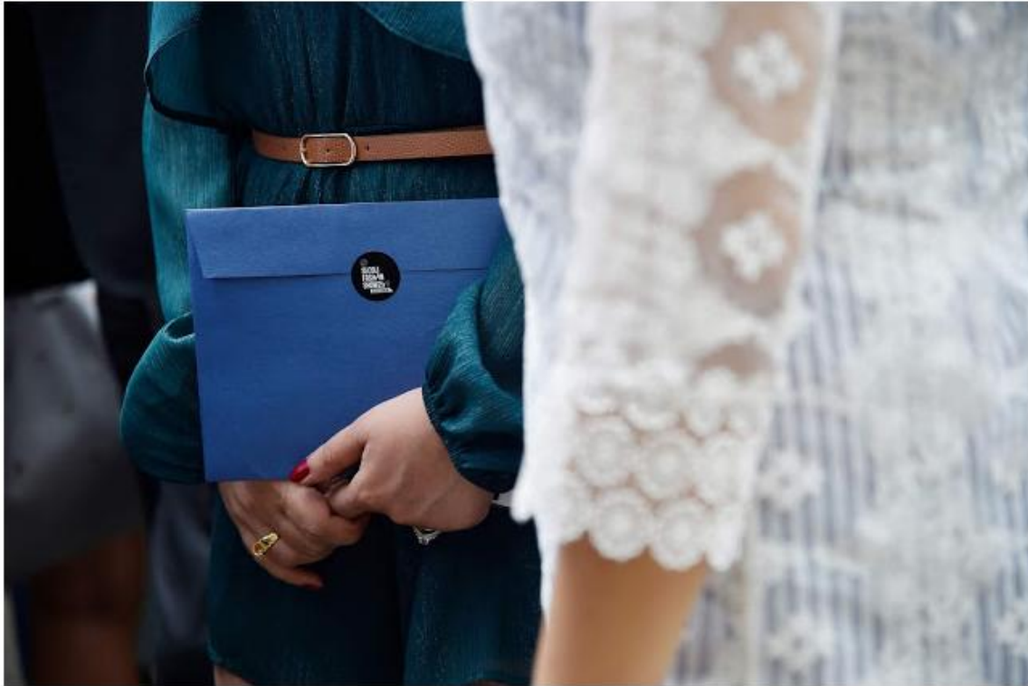
Backstage of the "Secoli Fashion Show"