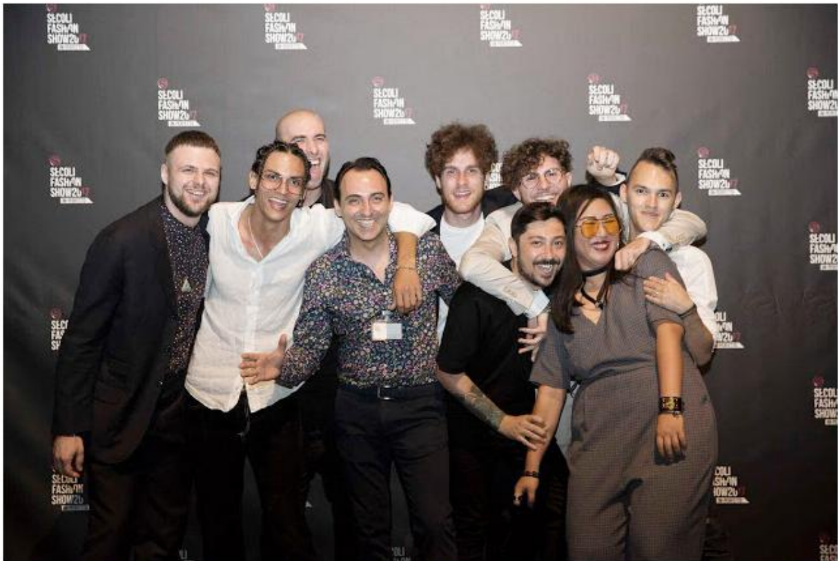
Students and teachers can finally enjoy the success after months of hard work for the preparation of the graduate collections for the "Secoli Fashion Show"