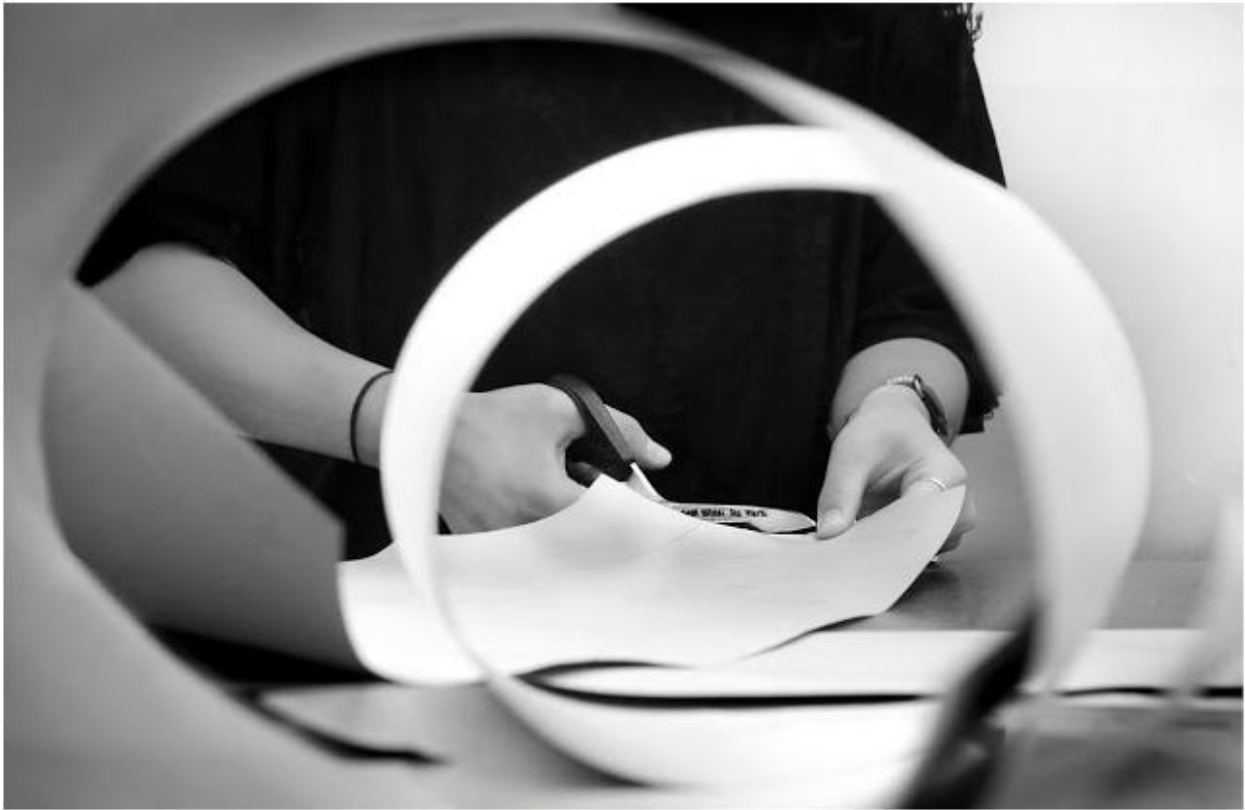
The "Secoli Method" for patternmaking

The school has also 14 short courses as introduction to different professions, for a refresh or specific on a particular topic theoretical or practical. The short courses can last some weeks or months, can be attended in summer or during the academic year.