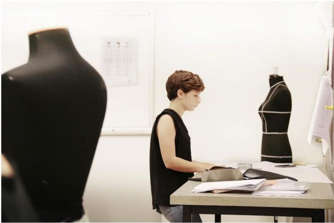
Student at work at Istituto Secoli