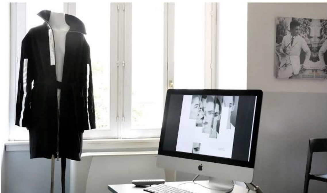
Lessons of Graphic Design for fashion

The school has also 14 short courses as introduction to different professions, for a refresh or specific on a particular topic theoretical or practical. The short courses can last some weeks or months, can be attended in summer or during the academic year.