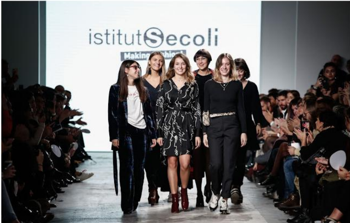
Six students of Istituto Secoli presented their capsule collection in the special project "Designer to Watch" at Fashion Graduate Italia 2018

Among the introductory courses to approach the "Secoli Method" there are some dedicated to fashion design and other more practical focused on patternmaking and sewing. The refresher courses are thought for professionals who already work in fashion industry and are on really specific topics like PATTERNS' DEFECTS CORRECTION , GRAPHIC DESIGN PHOTOSHOP or GRAPHIC DESIGN KALEDO STYLE LECTRA . The summer courses are dedicated to CAD patternmaking and menswear tailoring.