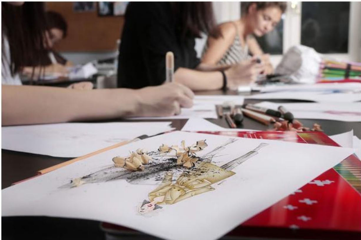
Students of the Fashion Design course

The "Secoli Method" is internationally recognized as one of the most valid and precise methods of patternmaking and tailoring. The students can choose from a rich educational assortment, many of which in English and Italian languages, suitable for every needs of young aspiring designers and also of who already has a job, but wants to refresh his skills or improve their career.