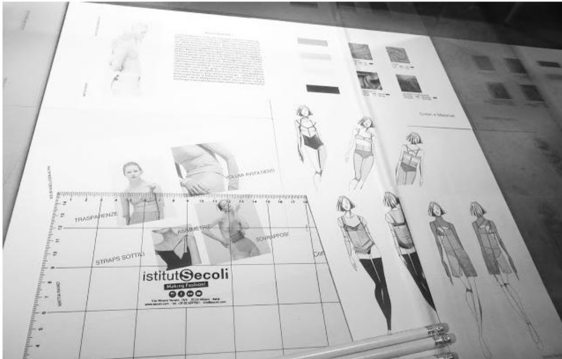
The "Secoli Method" for patternmaking presented at Fashion Graduate Italia 2017